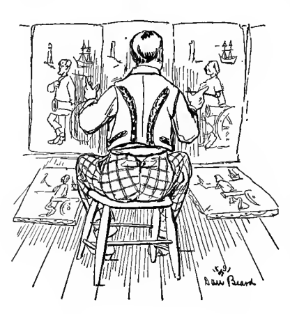
"NO. 5 STARTED A LAUGH."

Barrow took a frameless oil portrait a foot square from the box, set it up in a good light, without com-